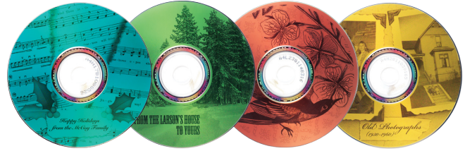
LightScribe Easy CD/DVD Labeling